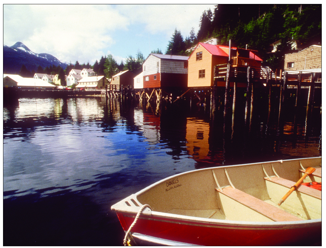
Pelican Boat Harbor, Commerce/DCRA